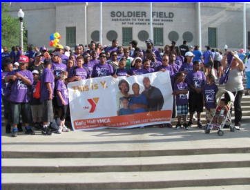
Mentoring Program participates in the Greater Chicago Food Depository Hunger Walk.

The adult mentor works with the parents to provide individual tutoring, support, new experiences and companionship as well as modeling healthy behavior and choices for the youth.