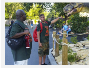
Mentoring Program visits the Negro Leagues Baseball Museum and the American Jazz Museum while visiting Kansas City, Kansas